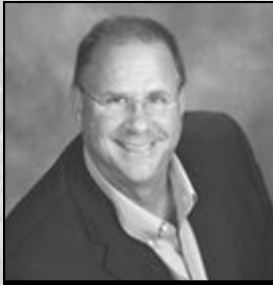
A Word From PB